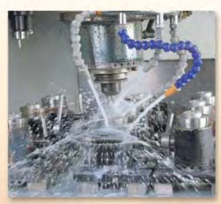
MPP offers a wide variety of value-added operations to enhance properties or provide additional precision.